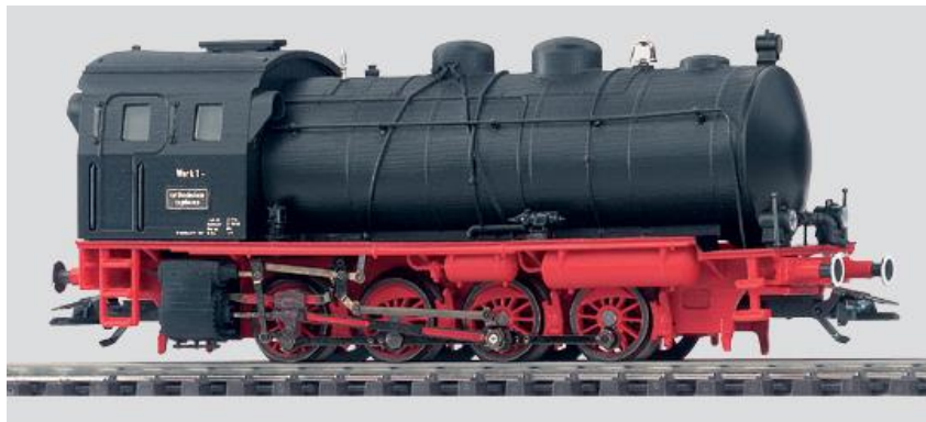
Marklin HO Gauge Fireless Locomotive

Models of fireless locomotives are not common. There are some vintage models made of brass. The Marklin Co. of Germany has made a couple of models since the mid 1990's and are very detailed and authentic.